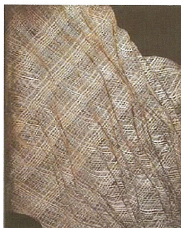
LORRAINE RASTORFER SHOKOLADE